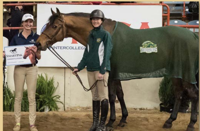
Cazenovia College's Collins, a 16.3-hand bay gelding, earned the Triple Crown High-Point Hunt Seat Horse Award. Skidmore College's Clay, a 16.3-hand dark bay gelding, received the SmartPak Most Popular Hunt Seat Horse Award.